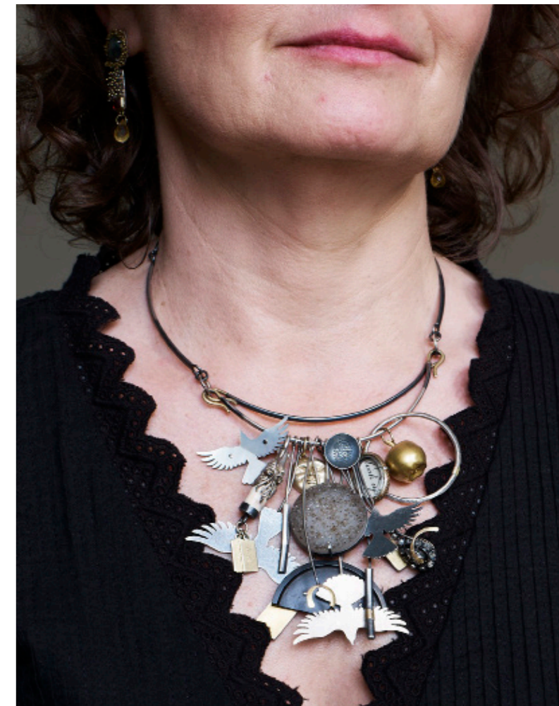
'Pull quote italic NAME